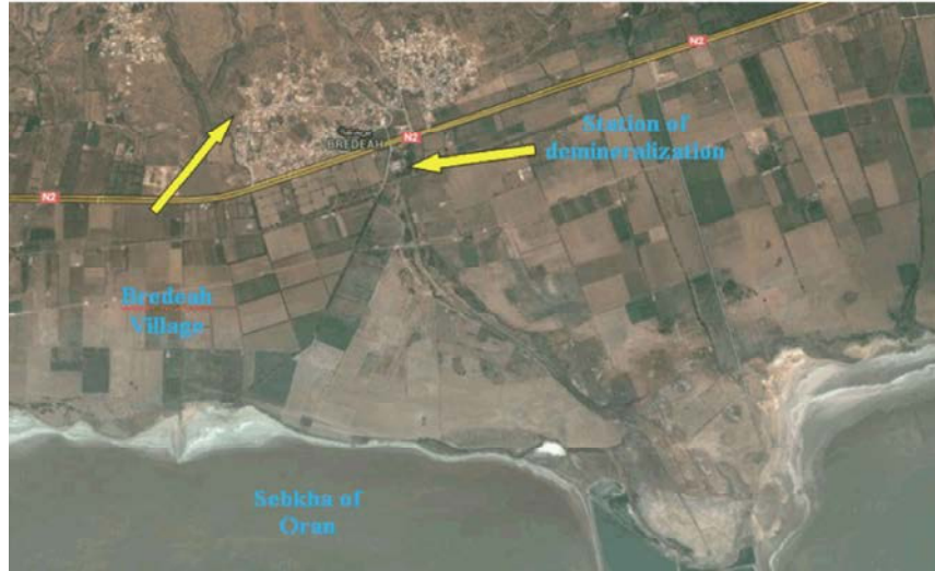
Fig. 1: Situation of the demineralization plant of Bredeah (google map).

Brine, usually discharged as wastewater, is the water stream in the desalination process that has higher salinity than the feed. Reject brine is the highly concentrated water in the last stage of the desalination process. Several types of chemicals are used in the desalination process for pre-and post-treatment operations. It is estimated that for every 1 m 3 of desalinated water, 2 m 3 is generated as reject brine and for every 1 m 3 of demineralized water, 1 m 3 is generated as reject brine in average.